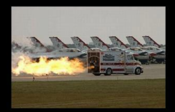
How the public sees me.