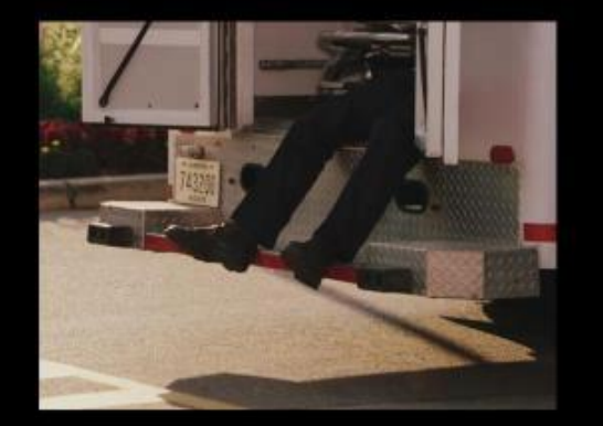
How my boss sees me.