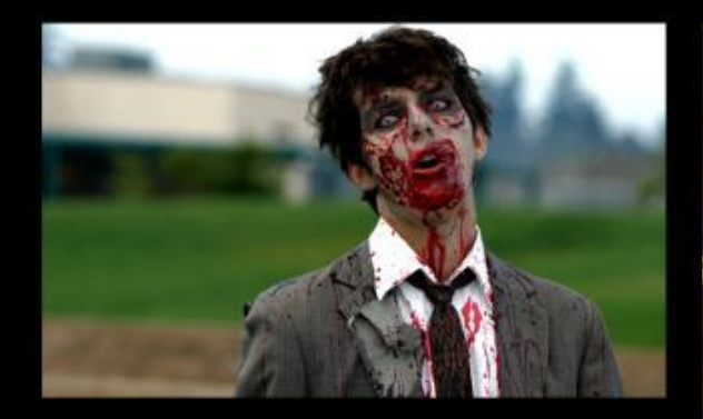
How I see me.