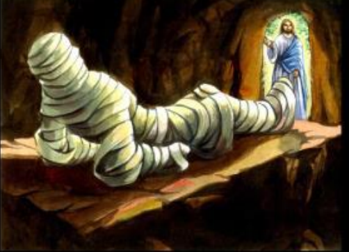
How my mom sees me.