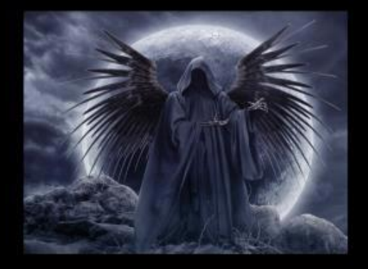
How the E.R sees me.